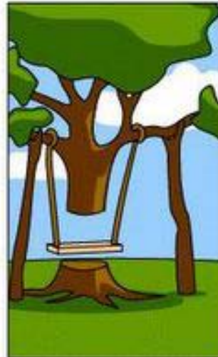
How the Analyst designed it