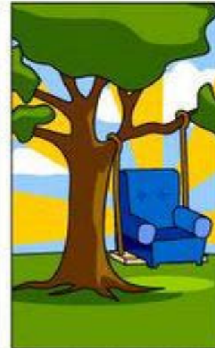
How the Business Consultant described it